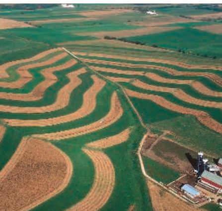
Fighting erosion. Contour stripcropping is one method used to protect soils.

IN THEIR PERSPECTIVE (“MONITORING EARTH’S CRITICAL ZONE,” 20 November 2009, p. 1067), D. deB. Richter Jr. and M. L. Mobley argue for the importance of monitoring Earth’s belowground critical zone for sustaining life and humanity.